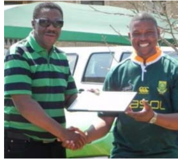
Appraisals SABC Auckland Park, City Power and OWLAG at HQ