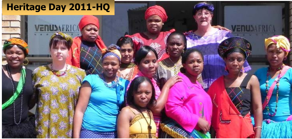
Heritage Day 2011-HQ